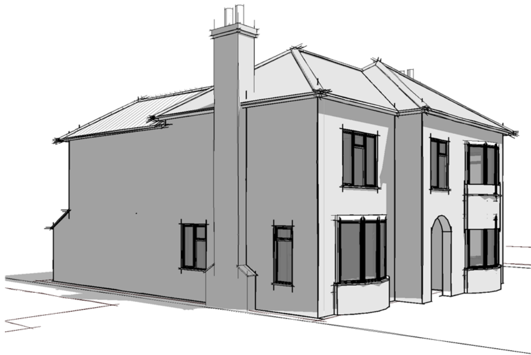
3D View 3